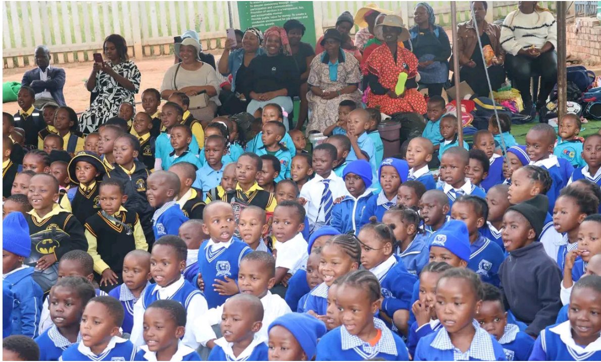
ECD centres and local pre-school children attended in numbers during the Library Week event, held at Vlakfontein Library.