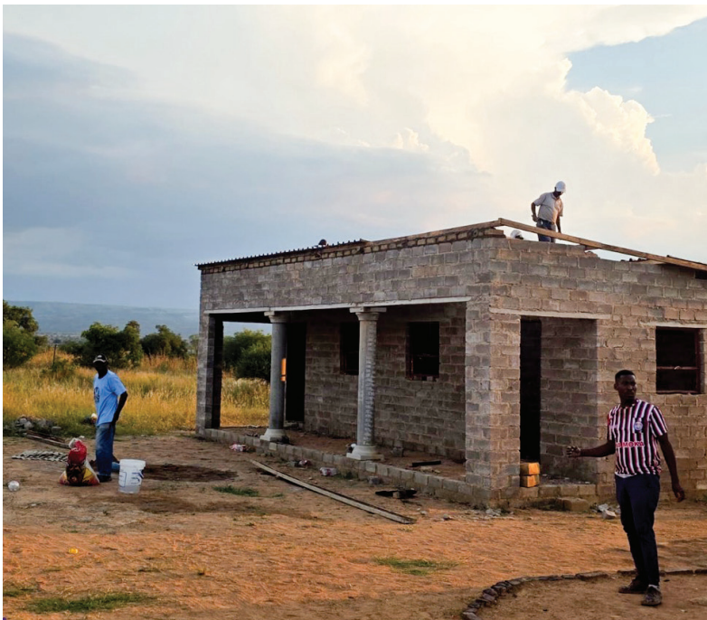
Management of Tswelopele Disability Centre appeals to the public with a conscience to come forward and help complete the project.

MARAPONG - In a heart-warming display of compassion and unity, the community of Marapong Village in Dennilton, has rallied behind the Tswelopele Disability Centre, a beacon of hope for vulnerable children with disabilities in the area.