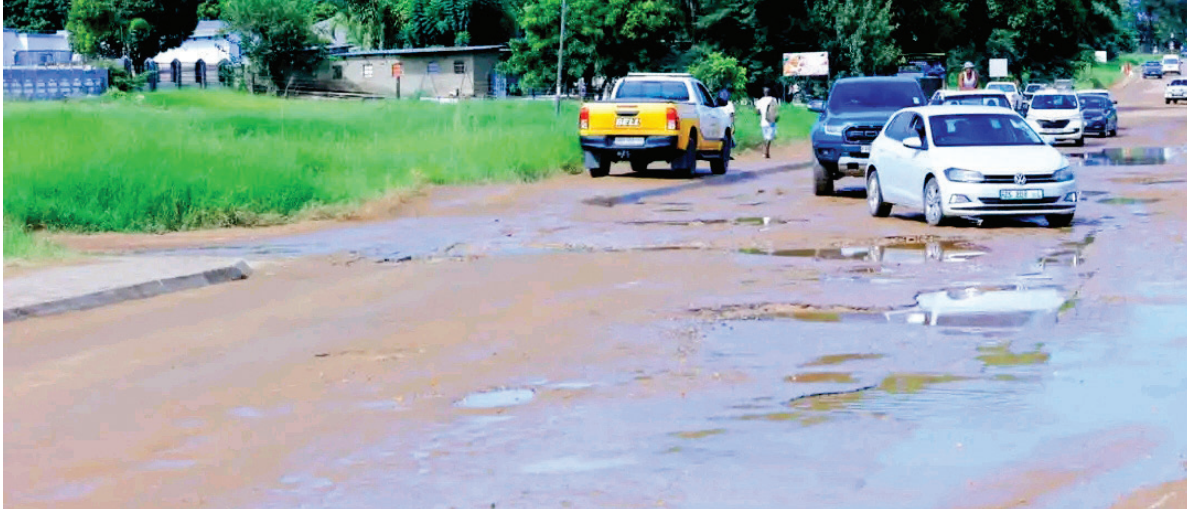
Motetema residents say they are worried that only roads leading to Elias Motsoaledi Municipality employees' households are getting attention, while the entire township is neglected.