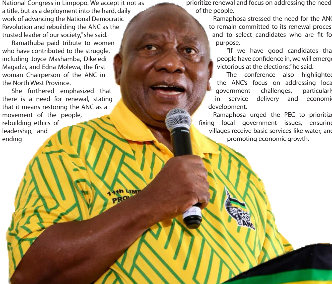
ANC National President, Cyril Ramaphosa, urged the newly elected Limpopo leadership to prioritize renewal and focus on addressing the needs of the people.