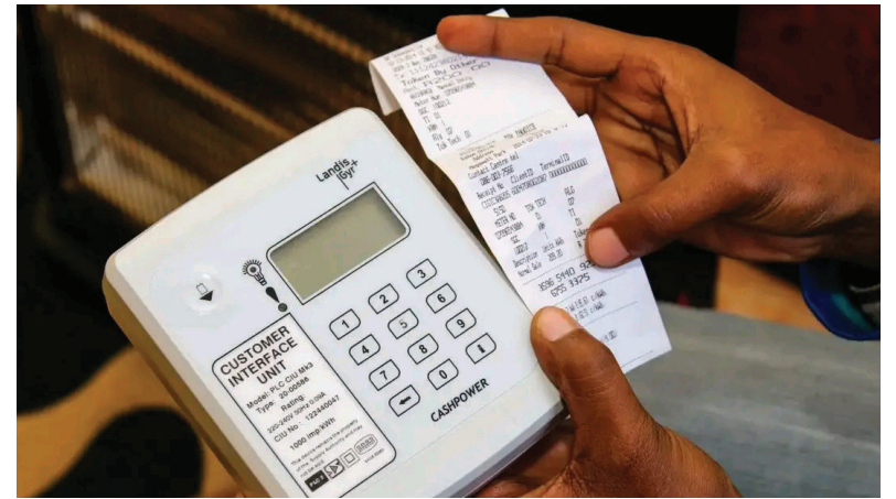
Residents of Ephraim Mogale Municipality are among disadvantaged communities in the country facing a struggle with electricity tariff hike.