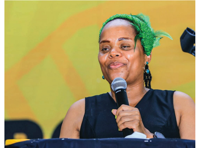
Dr Phophi Ramathuba

Ramaphosa urged the PEC to prioritize fixing local government issues, ensuring villages receive basic services like water, and promoting economic growth.